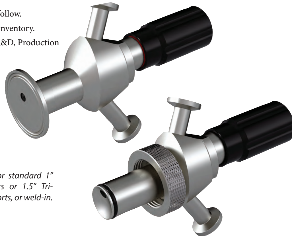
Available for standard 1" Ingold ports or 1.5" Tri-Clamp ports, or weld-in.